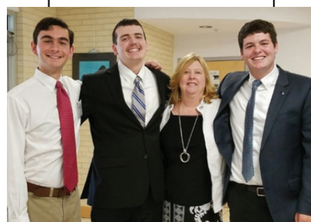
CBA seniors win VWU Marlin Prestige Shark Tank