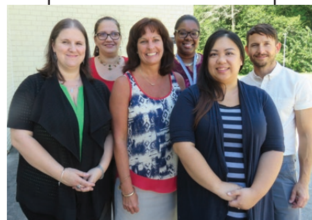
Graduate degrees in Sp. Ed. earned at Regent University by six CBA faculty members