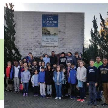
The food and consumer science lab, our new activity bus, plus more field trips and enrichment activities were the result of this year's Fund-A-Cause.