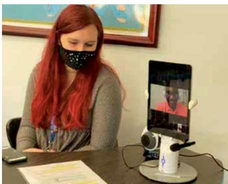
KUBI Telepresence Robots