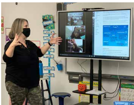
Vibe Interactive Collaboration Boards

CBA 3.0 will also work to provide for the future through the cultivation of an endowment through planned giving. By strengthening its financial position in all of these areas, Chesapeake Bay Academy will be able to respond to the immediate needs created by the pandemic, while continuing its exceptional service to Southeastern Virginia for the next 30 years and beyond.